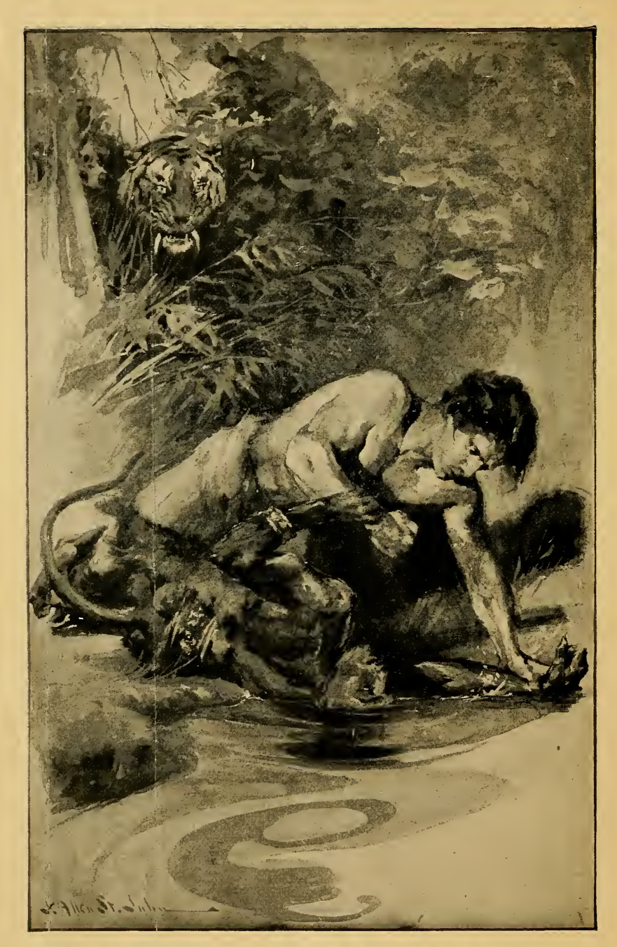
As the two antagonists battled, a devil-faced saber-tooth peered menacingly from the jungle