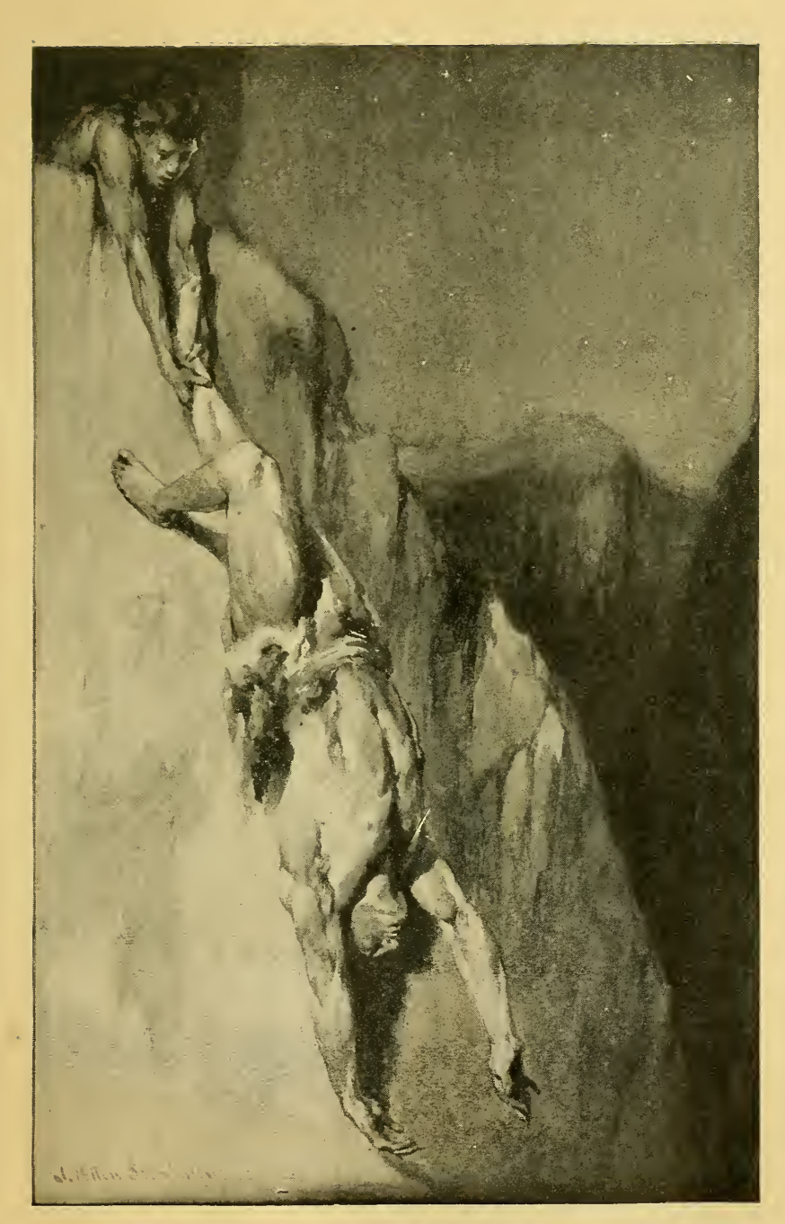
She felt her fingers numbing slowly to the strain upon them